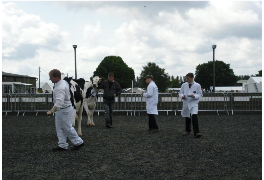
Berkshire YFC judging the dairy stock