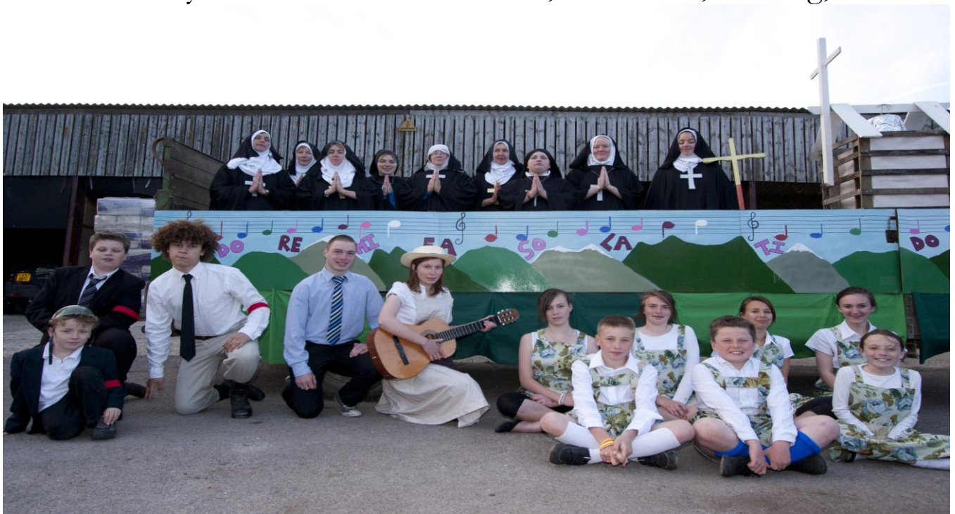
Shefford's Float at the 2011 Rally

Sat 21st May 2011 held at Perrins Farm, Beech Hill, Reading, Berks.