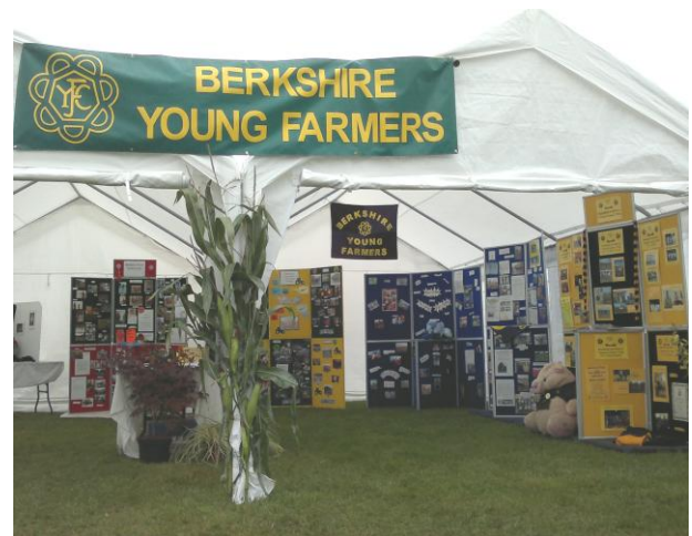
The County Stand with club boards