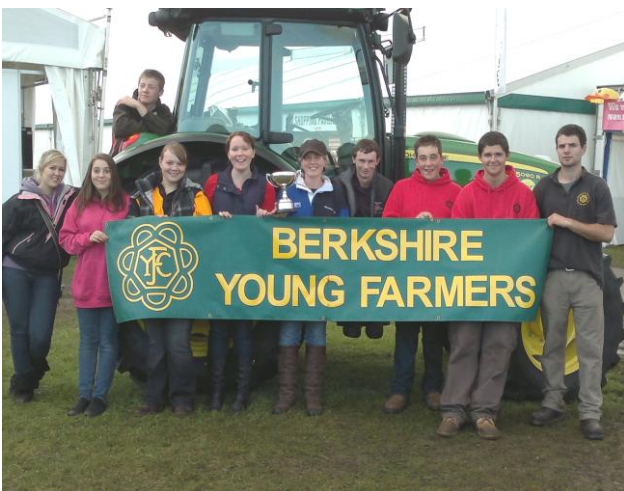
The takedown crew pose with the cup at the end of the Show

Thank you to everyone who helped, supported, transported, manned the stand, lent kit, gathered items and generally contributed to this years' effort – it was a great team effort. Exactly as it should be.